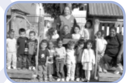
Thank you for helping us learn and grow!

We apologize for any omissions in our lists. Contributions received between July 1, 2003 and June 30, 2004. If you feel your name has been left out, please contact us at (562)591.0509. Thank you!