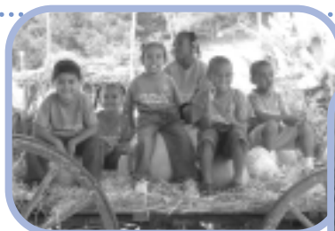
Above and right: Centennial Farm entrance fee raised by LBDN families collecting aluminum cans.