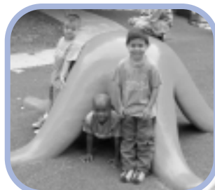
Left and below: Atlantis Park.