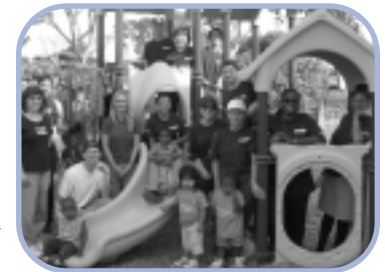
Nissan employees taking a break to play with LBDN children.