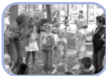
Above: LBDN Annual Family Picnic.