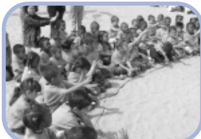
Above: Cabrillo Marine Aquarium.