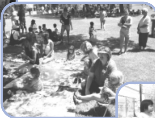
Left: Over 300 LBDN children and parents attended the annual family picnic at Heartwell Park.