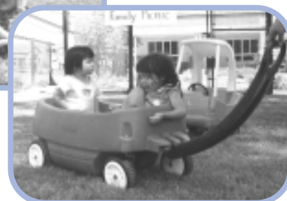
Below: Two small guests enjoy a ride to the picnic.