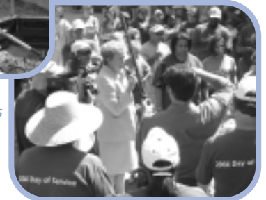
LBDN alumna Mayor Beverly O'Neill greets the volunteers.