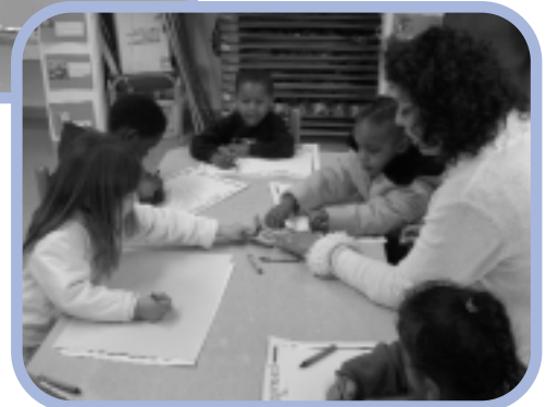
KaBOOM! playground planning session with Memorial children. Here the children are envisioning their new playground.

"I checked out various day care centers in the area and found they were real expensive. I chose the Memorial Branch because I was able to get a scholarship for my son to attend and his baby sitter works close by, so it was easy for me to leave him early in the morning."