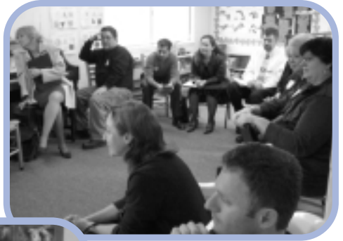
Above: Representatives from AARP, sponsors of the KaBOOM! playground project watch the children present their playground ideas.

Since 1995, KaBOOM! has been motivating communities nationwide to create healthy play opportunities for young people. At the start of 2004, KaBOOM! will have created almost 600 new playgrounds and improved more than 1,300 others. Headquartered in Washington, D.C., KaBOOM! also has offices in Chicago, Atlanta and Redwood City, CA. For more information, visit www.kaboom.org .