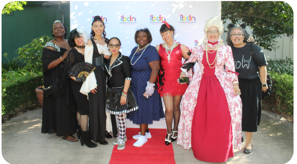
Our LBDN team in their awesome dramatic play outfits at our awards ceremony!