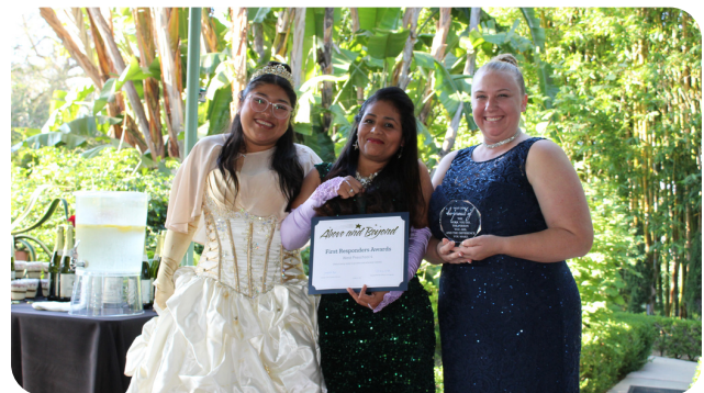
Preschool 4 receiving their classroom award.