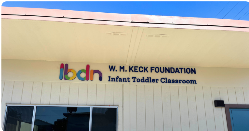
Pictured: New W.M. Keck Foundation lettering on our modular unit.