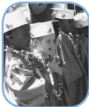
East and West Branches say goodbye to our little ones as they graduate from LBDN preschool and enter kindergarten. See page 3.