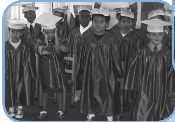
West Branch Graduates.

The East Branch Parent Advisory Committee purchased beautiful robes for the class to wear and loaned them to the West Branch for their ceremony. The funds came from the East PAC See's Candy fund raiser last November. We thank the PAC for the gift and we will take good care of the robes so that many future classes can enjoy them for years to come.